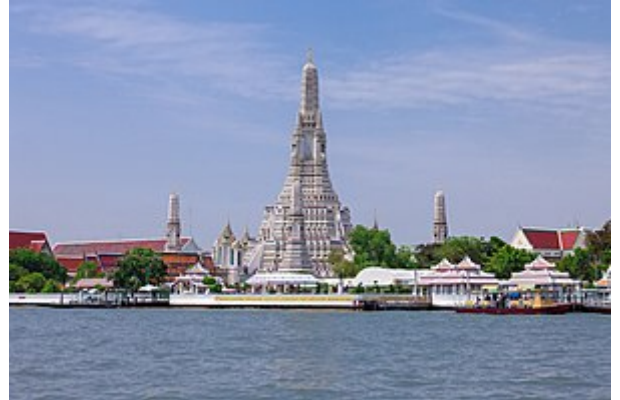
Wat Arun's pagodas were built and located to simulate the Buddhist Cosmology

It consists of temporal and spatial cosmology: the temporal cosmology being the division of the existence of a 'world' into four discrete moments (the creation, duration, dissolution, and state of being dissolved; this does not seem to be a canonical division, however). The spatial cosmology consists of a vertical cosmology, the various planes of beings, their bodies, characteristics, food, lifespan, beauty and a horizontal cosmology, the distribution of these world-systems into an "apparently" infinite sheet of "worlds". The existence of world-periods (moments, kalpas), is well attested to by the Buddha. [1][2]